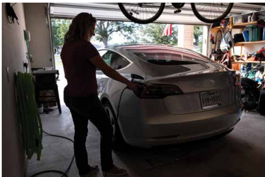
Deanna Bodine plugs a charger into the back of her Model 3 Tesla in the garage of her Bastrop home using a 240-volt outlet, the type typically used for clothes dryers. Bodine says charging the car has little noticeable effect on her monthly power bill.

San Marcos: 12 Tesla Superchargers at San Marcos Premium Outlets, 3939 S. I-35, payment required based on usage