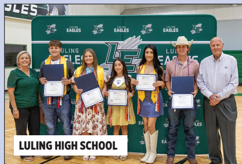
LULING HIGH SCHOOL