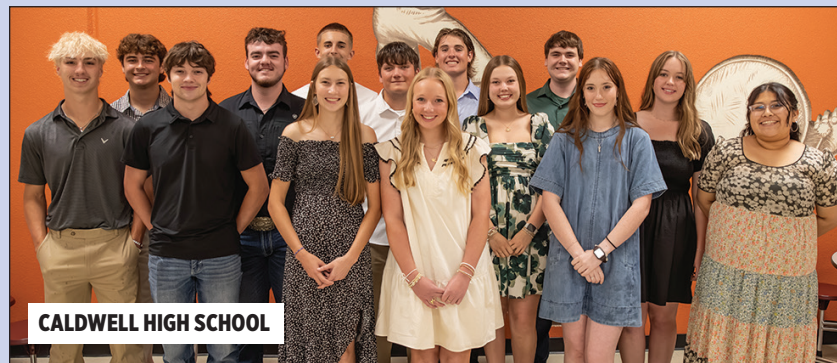
CALDWELL HIGH SCHOOL