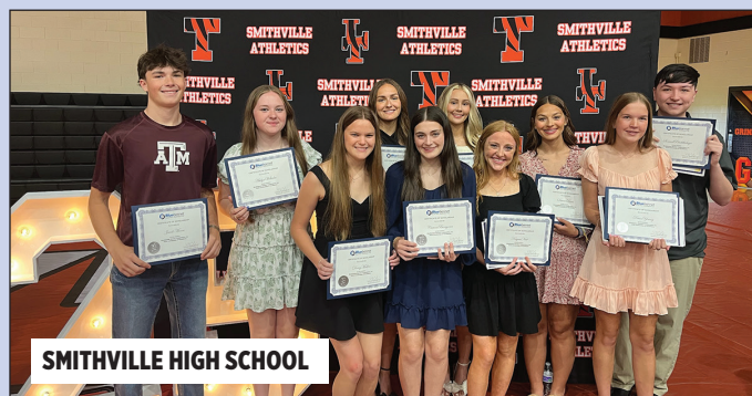
SMITHVILLE HIGH SCHOOL