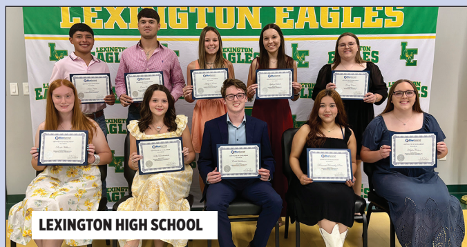
LEXINGTON HIGH SCHOOL