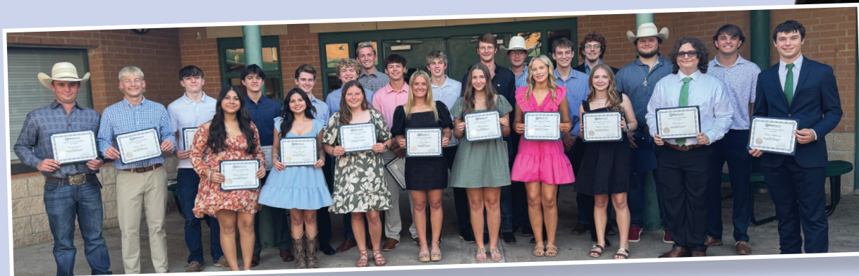
Brenham High School students hold their Scholarship of Excellence certificates at a reception on May 14. Students from 29 schools across the service area were recognized. See a full list of recipients and photos from other events on Pages 20-21.

YEARS BLUEBONNET HAS AWARDED SCHOLARSHIPS