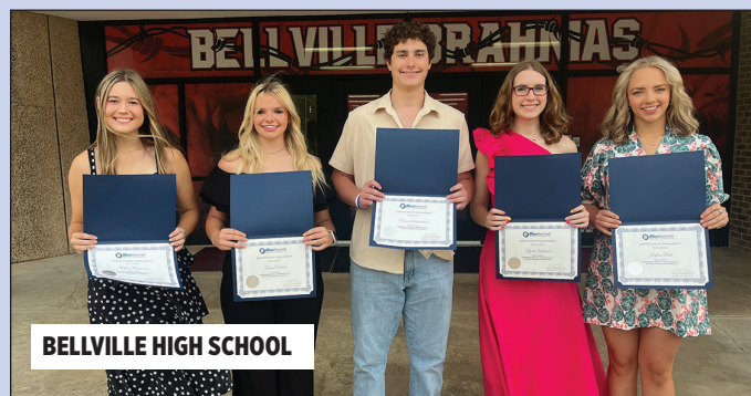
BELLVILLE HIGH SCHOOL