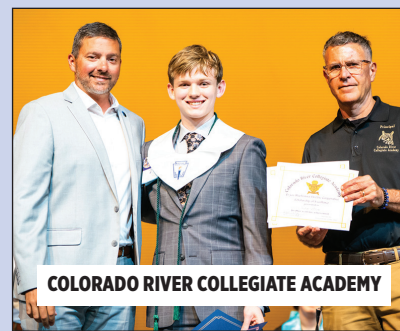
COLORADO RIVER COLLEGIATE ACADEMY