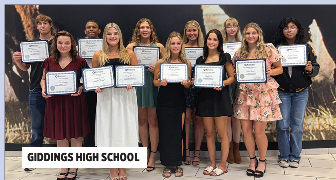
GIDDINGS HIGH SCHOOL