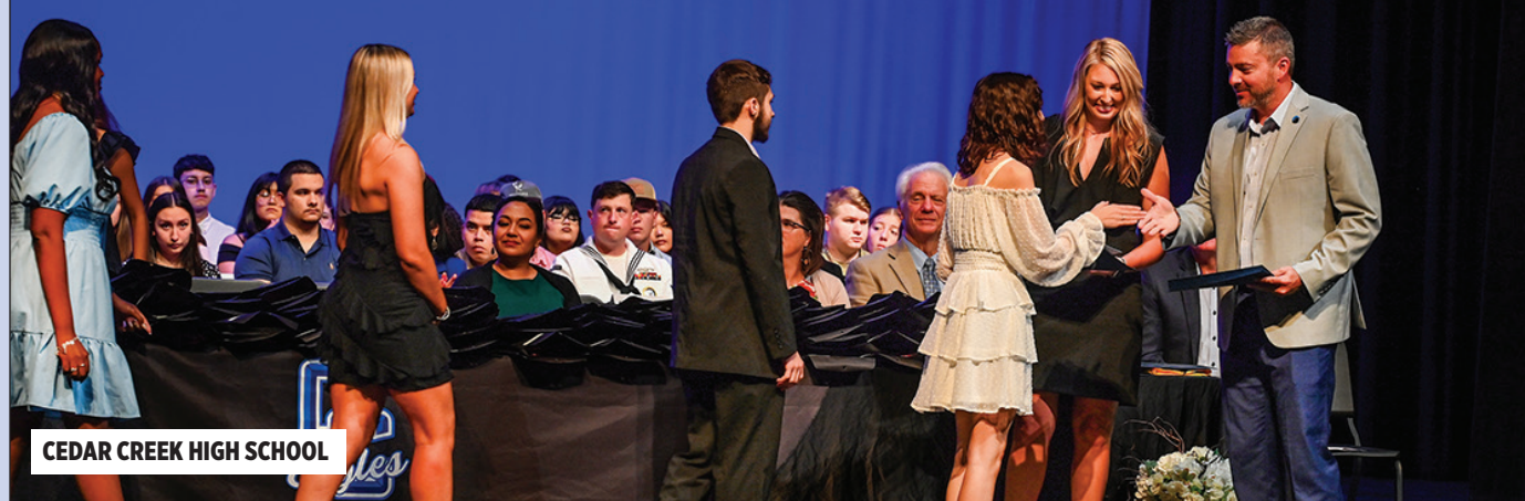
CEDAR CREEK HIGH SCHOOL