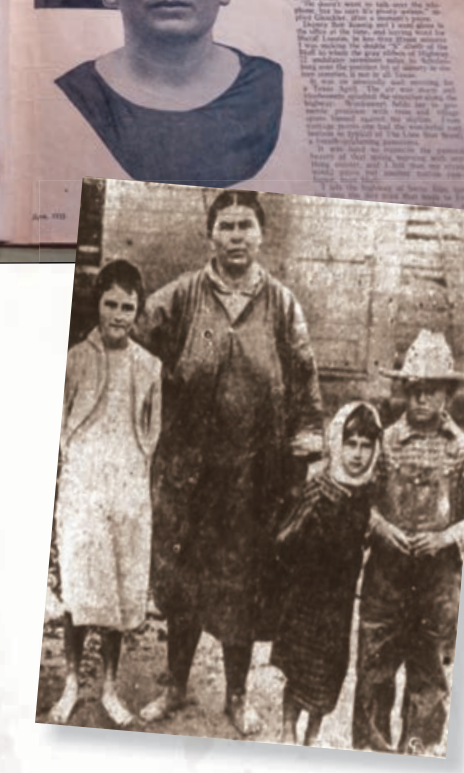
Goose Creek Daily Sun photo, August 1933 (courtesy Sterling Municipal Library, via The Portal to Texas History)

It took two days of questioning two jury pools — 125 men — to find 12 qualified jurors. Women were not