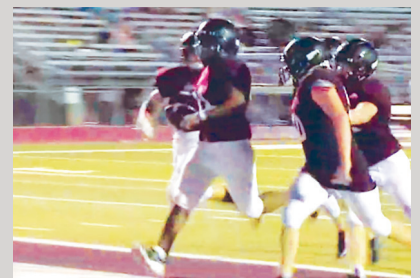
See the viral video at https://tinyurl. com/y5nm5k4p

"Hopefully it was six seconds that everybody in attendance was able to take a little bit of a deep breath and say, 'You know what? Everything is going to be all right,' "Moebes told reporters at the scrimmage."