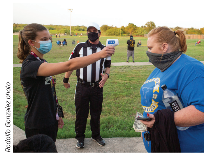
A temperature check is a standard part of entering a stadium or field of play these days, including at 6-man football games like the one between Prairie Lea and Dime Box on Sept. 11. Dime Box won the season opener 45-0.

An exception will be made if the home team's county has had 20 or fewer new COVID-19 cases in the previous two weeks, according to the governor's mandate.